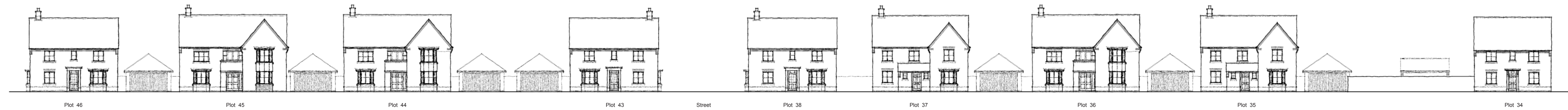
STREET SCENE C-C