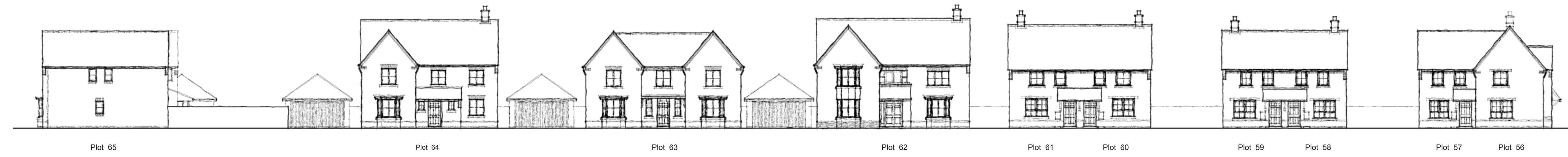
STREET SCENE B-B