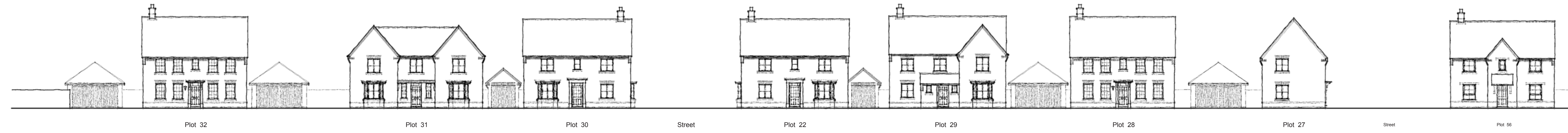
STREET SCENE A-A